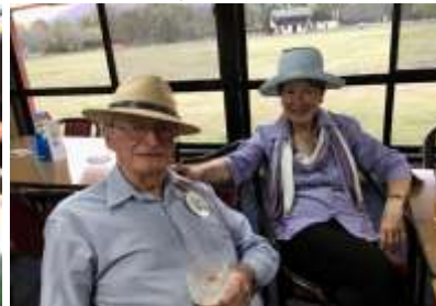
The Dixons with their Farmers Hat