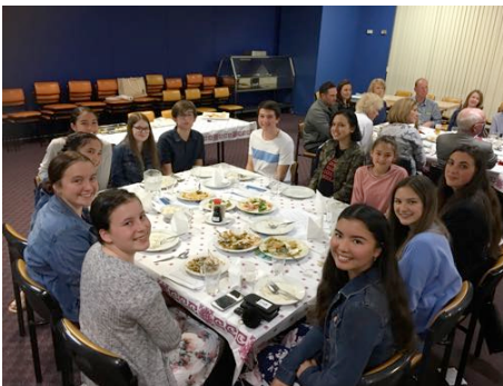
Table of Future Leaders