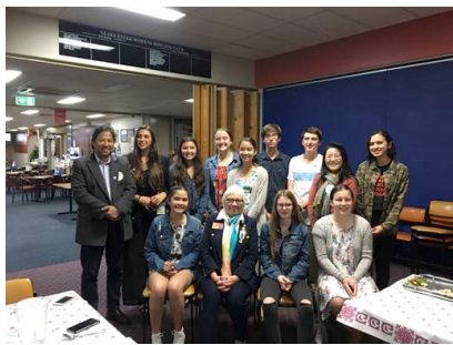
Rotaract and Interact Clubs.