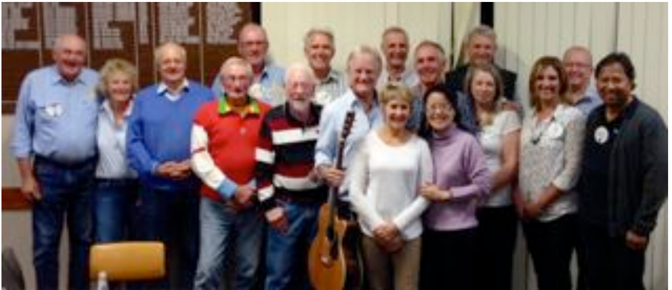
Meeting closed with our guest leading us in the National Anthem.