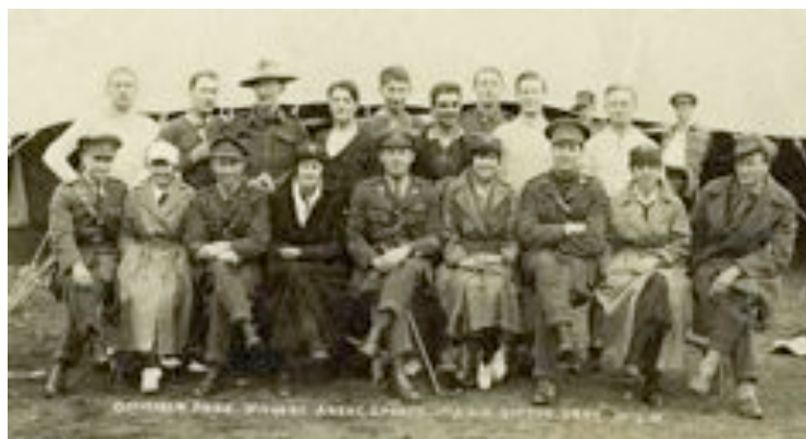
Albert Jacka at Anzac Sports Day 1919

For most conspicuous bravery on the night of the 19-20th May, 1915, at Courtney's Post, Gallipoli Peninsula. Lance Corporal Jacka, while holding a portion of our trench with four men, was heavily attacked. When all except himself were killed or wounded, the trench was rushed and occupied by seven Turks. Lance Corporal Jacka at once most gallantly attacked them single-handed and killed the whole party, five by rifle fire and two with the bayonet.