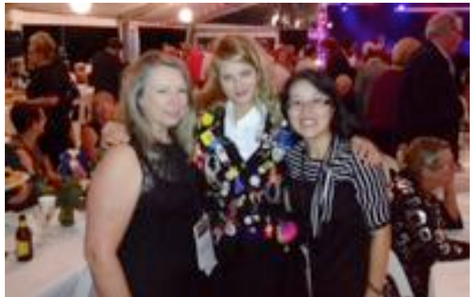
Found her at last with her awesome jacket!!