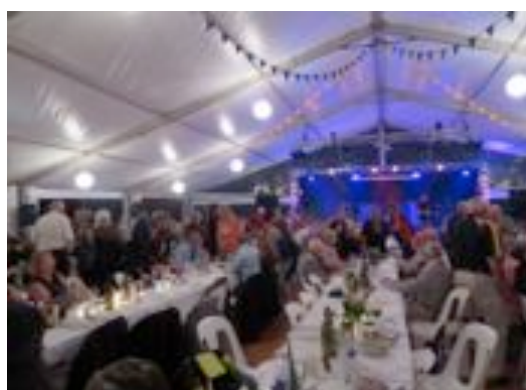
The beautiful Marquee by the riverbank