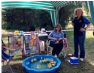
Pluck A Duck Volunteers