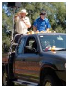
Auction in Action