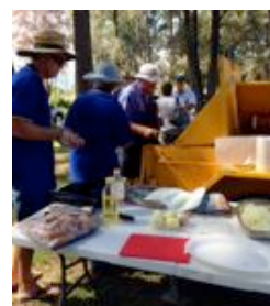
our BBQ Chefs