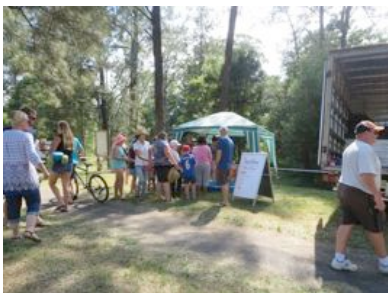
Pluck A Duck Queue