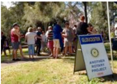
Queue of people lining up