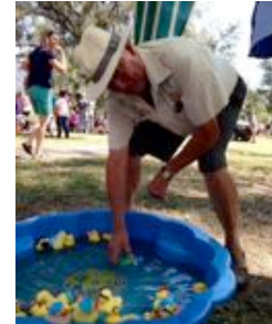
Rotarian Denver Plucking a duck