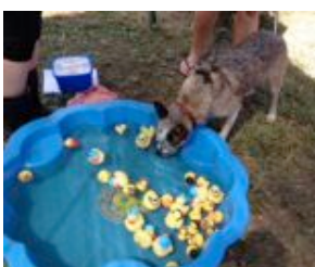
Doggie wants a duck too