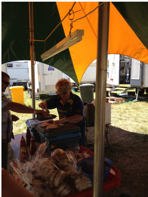
Our Ash serving up a treat.