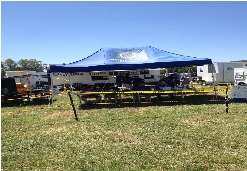
One of the two Workstations at Dungog.