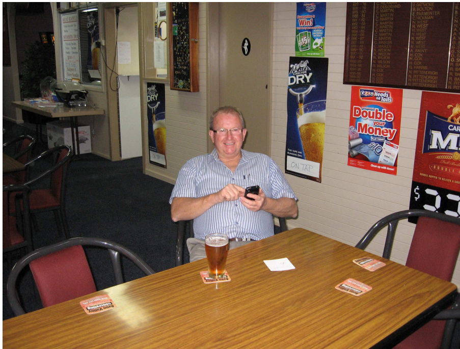
The quizmaster sits all alone checking his answers and about to down one of the many gifts provided by the winning team!