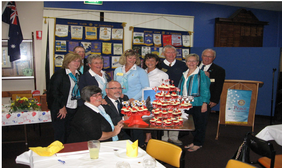
The Friendship Exchange Group look at the special cakes made in their honor by local Gloucester friends.