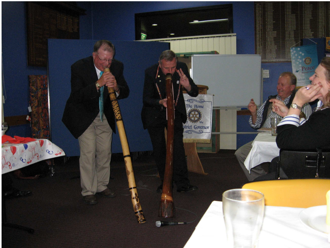
Rotarians Making Music!