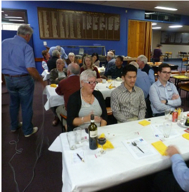
A very pensive group waiting for dinner.