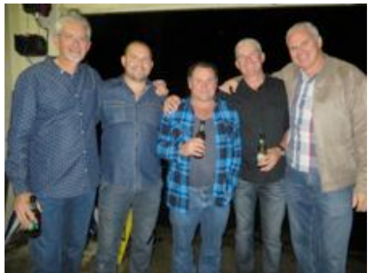
The Bowden Brothers - great party music