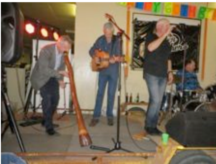
Bees helped out for a bit