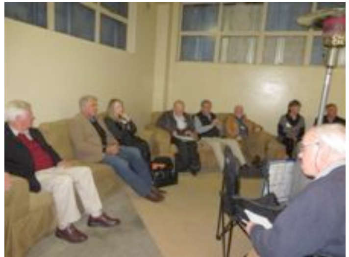
The Board Meeting prior to the party - I guess the DG was there somewhere