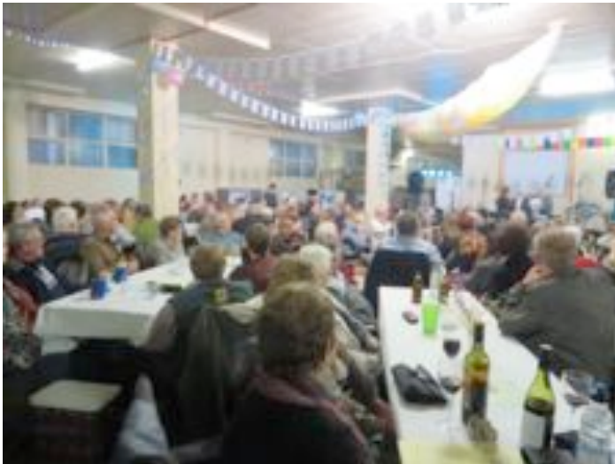
Some of the crowd