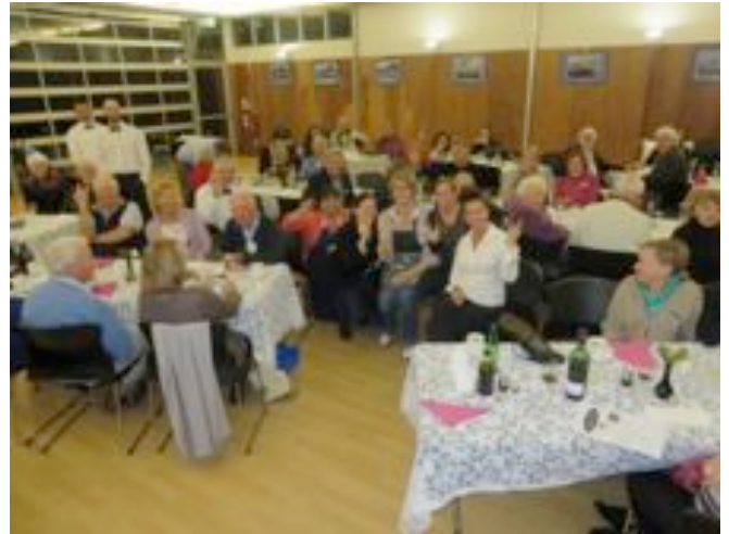
The crowd saying 'goodbye to Polio'