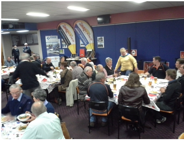
A little look at the gathering.