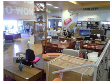
Items Pictured are just a representative sample.

50% of the proceeds will be donated to Australian Rotary Health to fund indigenous Health Scholarships.