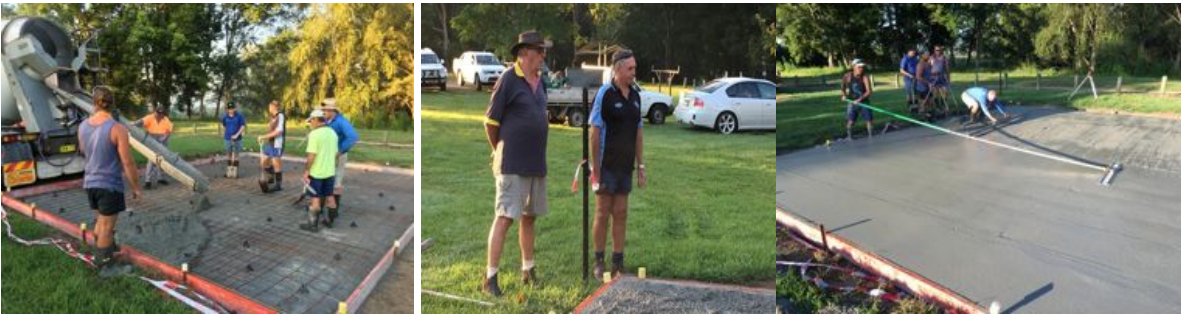
The completed job and the fellows.

The concrete is laid in Gloucester Park for exercise station 3.