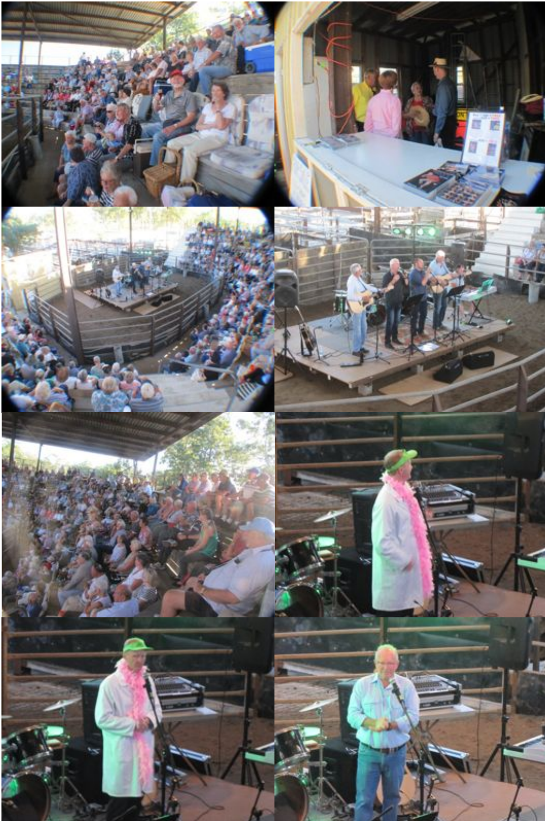
Some pictures of the Poetry in the Sale Yards what a happy crowd.