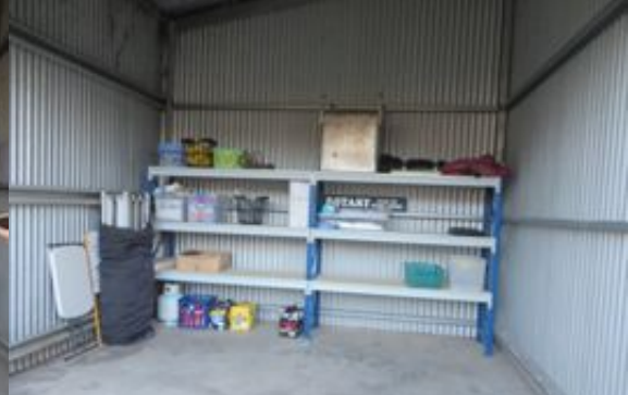
How good does this look? well done everyone.