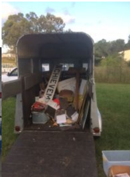
The finishing touches by Grahame and the loaded horse trailer.