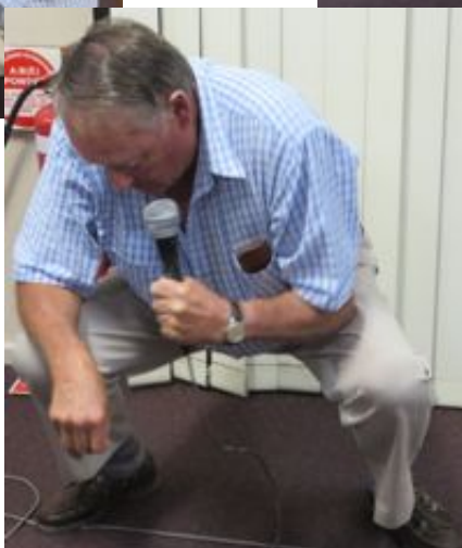
Denver hour wind racing by. Hang onto the toilet