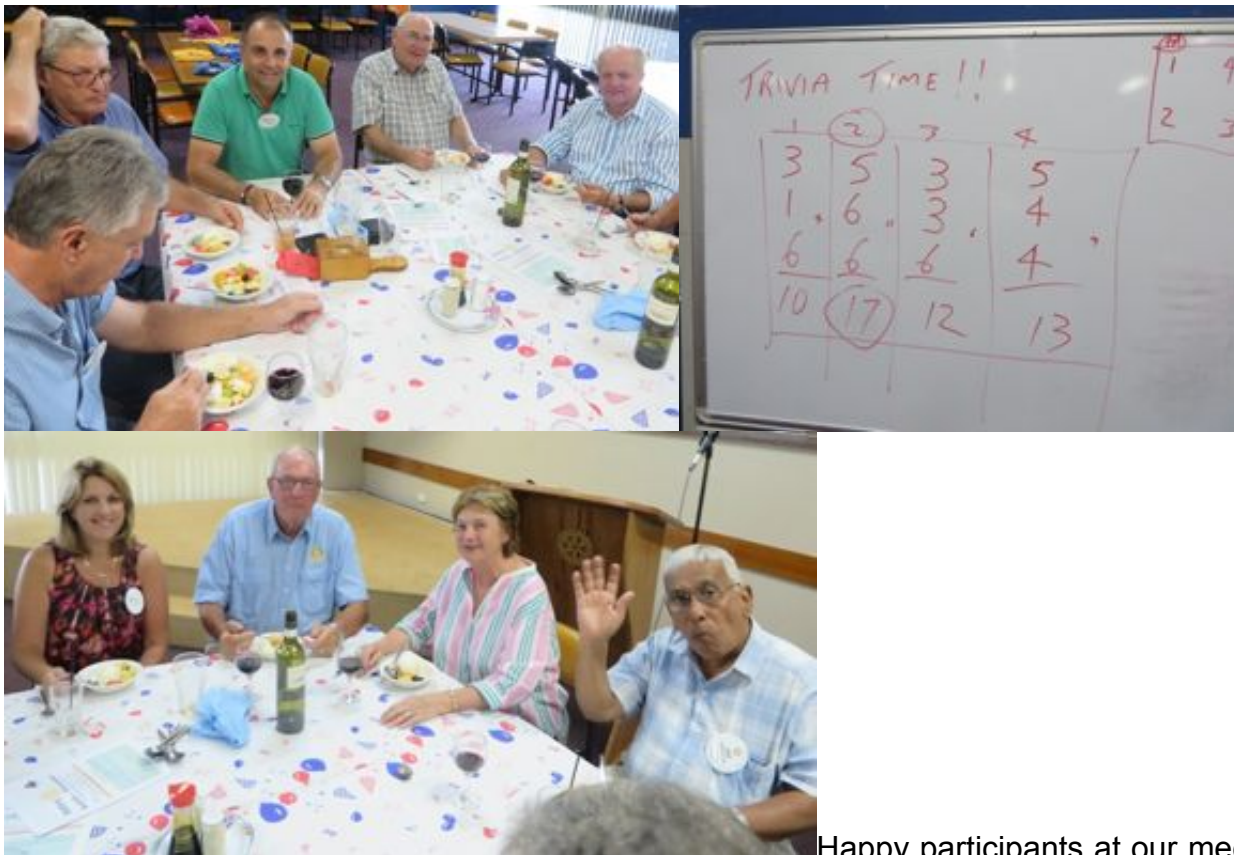
Happy participants at our meeting and the score sheet above. Congratulation team 2.

Fines and Raffle and then the National Anthem. Meeting closed at 2015 for some more fellowship. See you all next week.