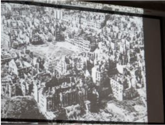
WW1 bombing in Warsaw