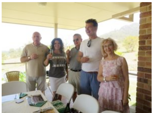
The Polish team on Radford's deck