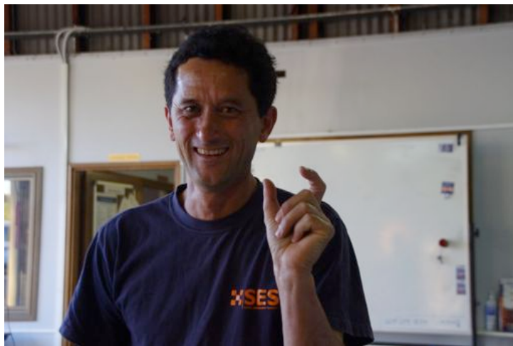
showed us around the shed and equipment.