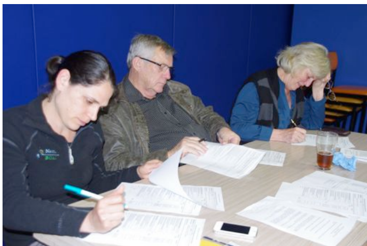
The Adjudicators hard at work

All students presented excellent speeches and all addressed Rotary’s 4 way test