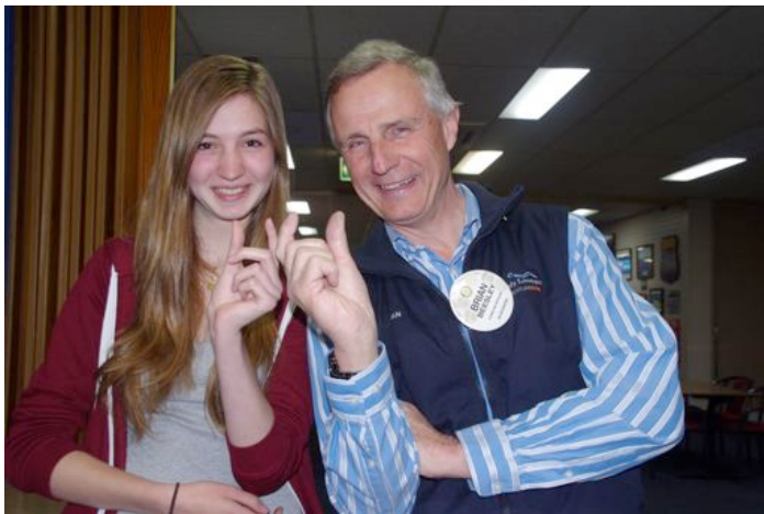
'this close to ending Polio'