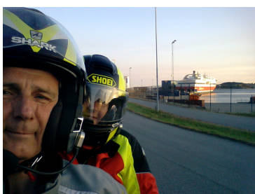
with Bees and Heather