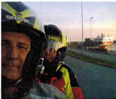
Riding in Denmark