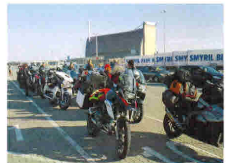
More bikes in Norway