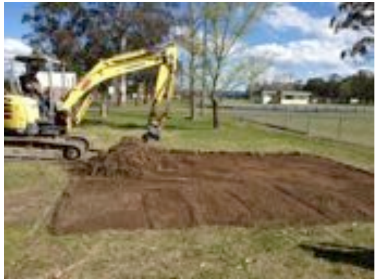
Exercise equipment slab preparation and pour.