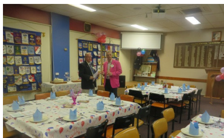
The night is being planned Bees & Pete

The evening concluded with Advance Australia Fair.