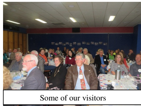
Some of our visitors