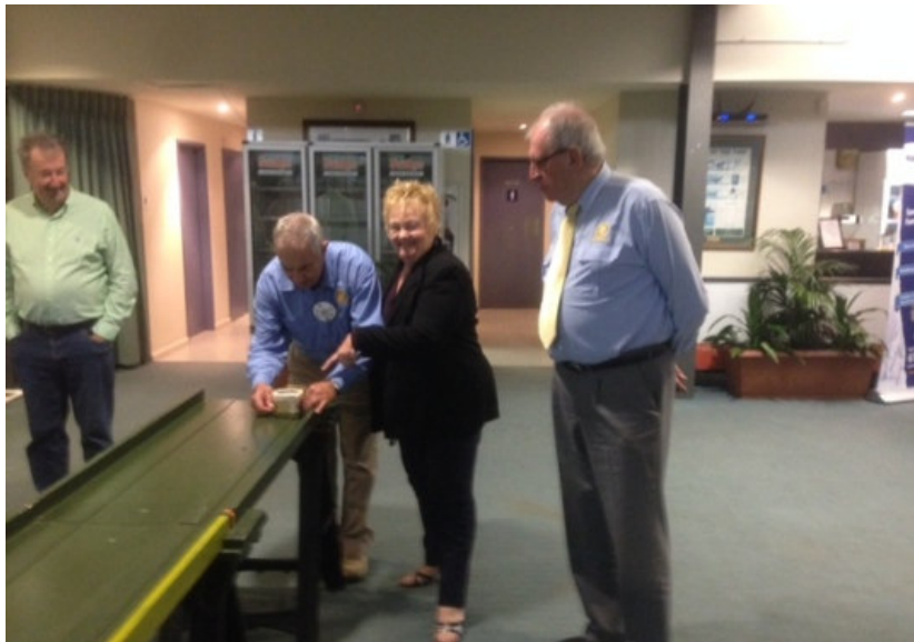
Just about to take off waiting for the other car to arrive.