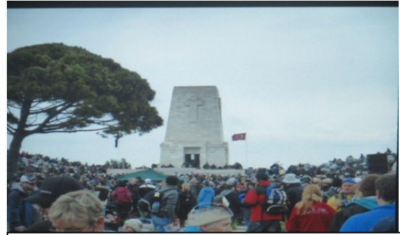
Lone Pine memorial