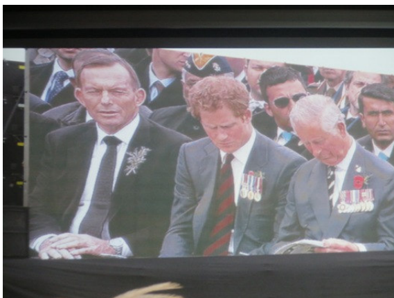
The Hon Tony Abbott PM Australia Prince Harry and the Prince of Wales.

The evening finished with the National Anthem.